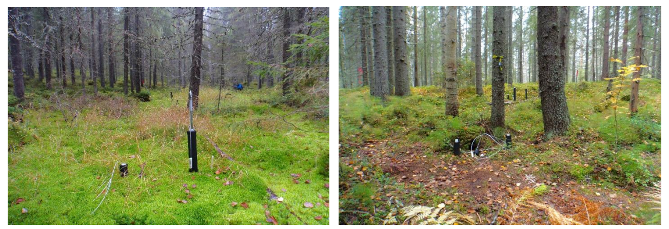
Figure 2. An example of GW discharge (left) and non-discharge (right) sites with riparian and transition wells. Pictures are taken standing in the stream.

We have installed GW wells at 11 pairs of GW discharge and non-discharge sites along 3 headwater streams within the Krycklan catchment (Fig. 1). For the site selection, a hydrological model of GW flow paths was created (A. Ågren, simplified version of the model on Fig. 1) and the GW discharge locations were visually confirmed in the field. At each site we installed 5 GW wells in total (Fig. 1), at three distances from the stream, i.e., 3 m (two riparian wells), 10 m (two transition wells) and 20-30 m (one upland well). The wells were installed in depth between 50 and 200 cm, based on local soil structure and depth to bedrock. For the paired wells (i.e., riparian and transition), one well is used for GW sampling and one well for water level and temperature monitoring. Due to instrument failures we were not able to continuously monitor GW levels and temperature, however new instruments will be installed shortly (TrueTrack water level loggers, New Zealand). The GW wells installation was finalized in August 2015 (example on Fig. 2). The wells are installed permanently and will continue to be monitored in the coming years.